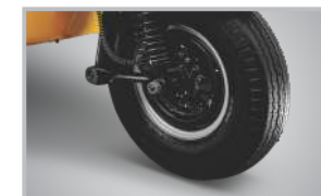
Tubeless Tyres First in 3 Wheeler Segment