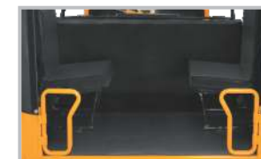
Rear footstep entry