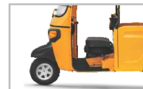
Comfortable Driver Cabin